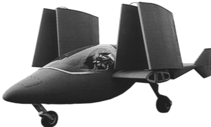
FIGURE 1-2: PIRANHA WING-FOLD SYSTEM

PORTABILITY - The PIRANHA is designed to be road portable, using a standard truck or small trailer. This allows the aircraft to be carried along with the patrol or unit it will support. The simple wing-fold system does not require any control system disconnects.