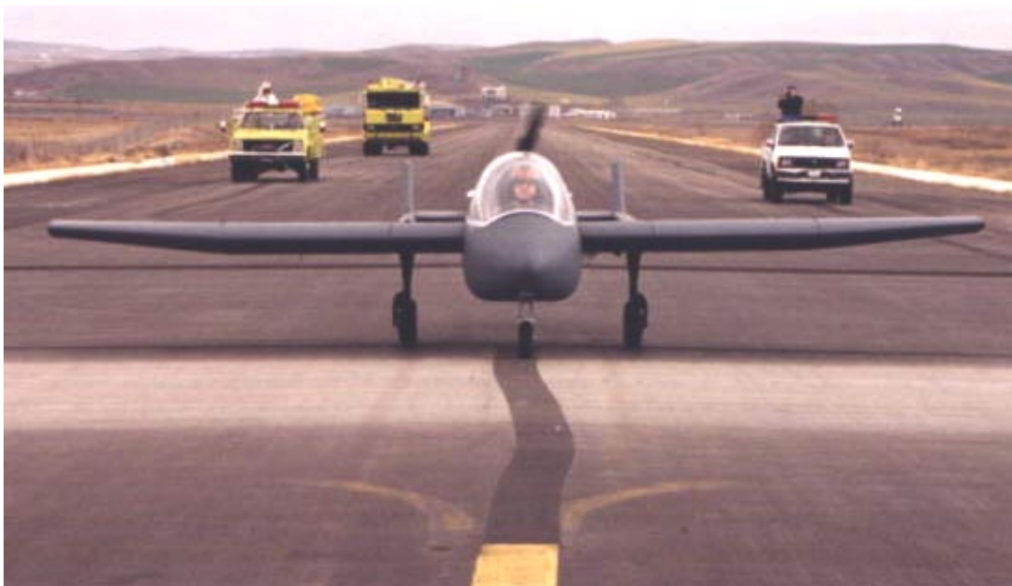
PIRANHA TAXIING OUT FOR FIRST FLIGHT, APRIL 1997