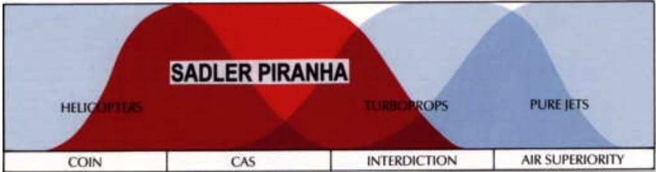
FIGURE 4-1: SADLER PIRANHA MISSION SPECTRUM

The PIRANHA is designed to fit into missions that are between those of a helicopter and those of a turboprop airplane, as shown in fig. 4-1. Missions ideal for the PIRANHA include small military actions, counter insurgency activities, border patrol and interdiction, and counter narcotic activities.