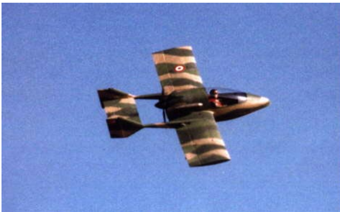
PIRANHA DEMO FLIGHT TO TURKISH ARMY GENERAL STAFF, MAY 1998