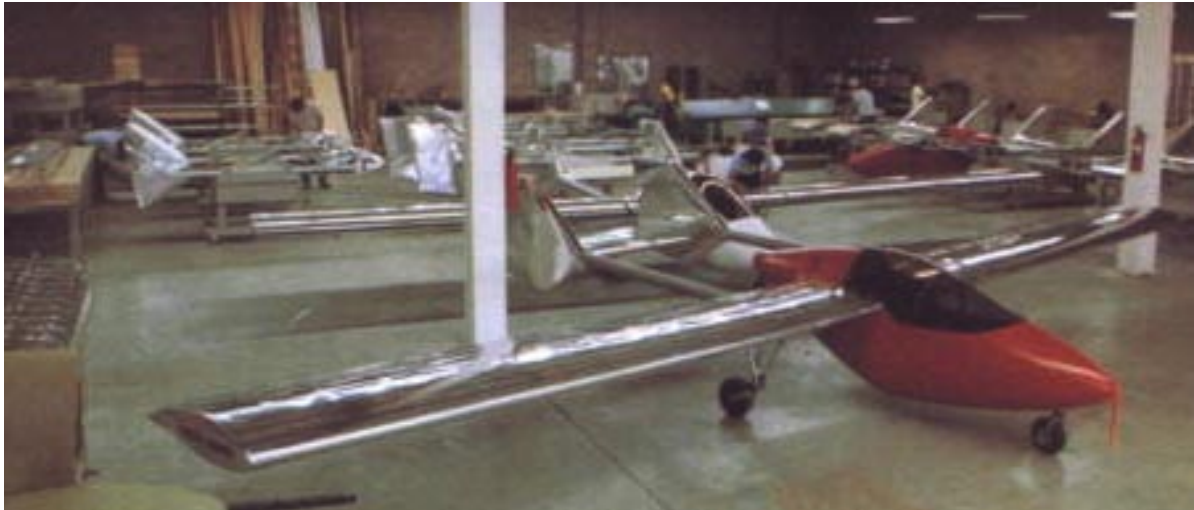
FIGURE 8-1: PRIOR SADLER PRODUCTION FACILITIES

Because the Sadler Piranha has been designed for the simplest "cut, bend and rivet" production methods, our tooling needs are greatly simplified. All subcontract tooling for items such as wing ribs and the Kevlar fuselage pod are in place and subcontractors are ready to supply parts immediately.