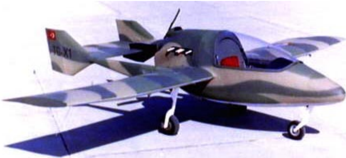
FIGURE 1-1: SADLER PIRANHA

Sadler Aircraft's approach to solving the problem of providing a low cost, effective airborne ordnance delivery system is based on the design of a mission-specific aircraft that has been optimized for this task. The SADLER PIRANHA is shown in figure 1-1.